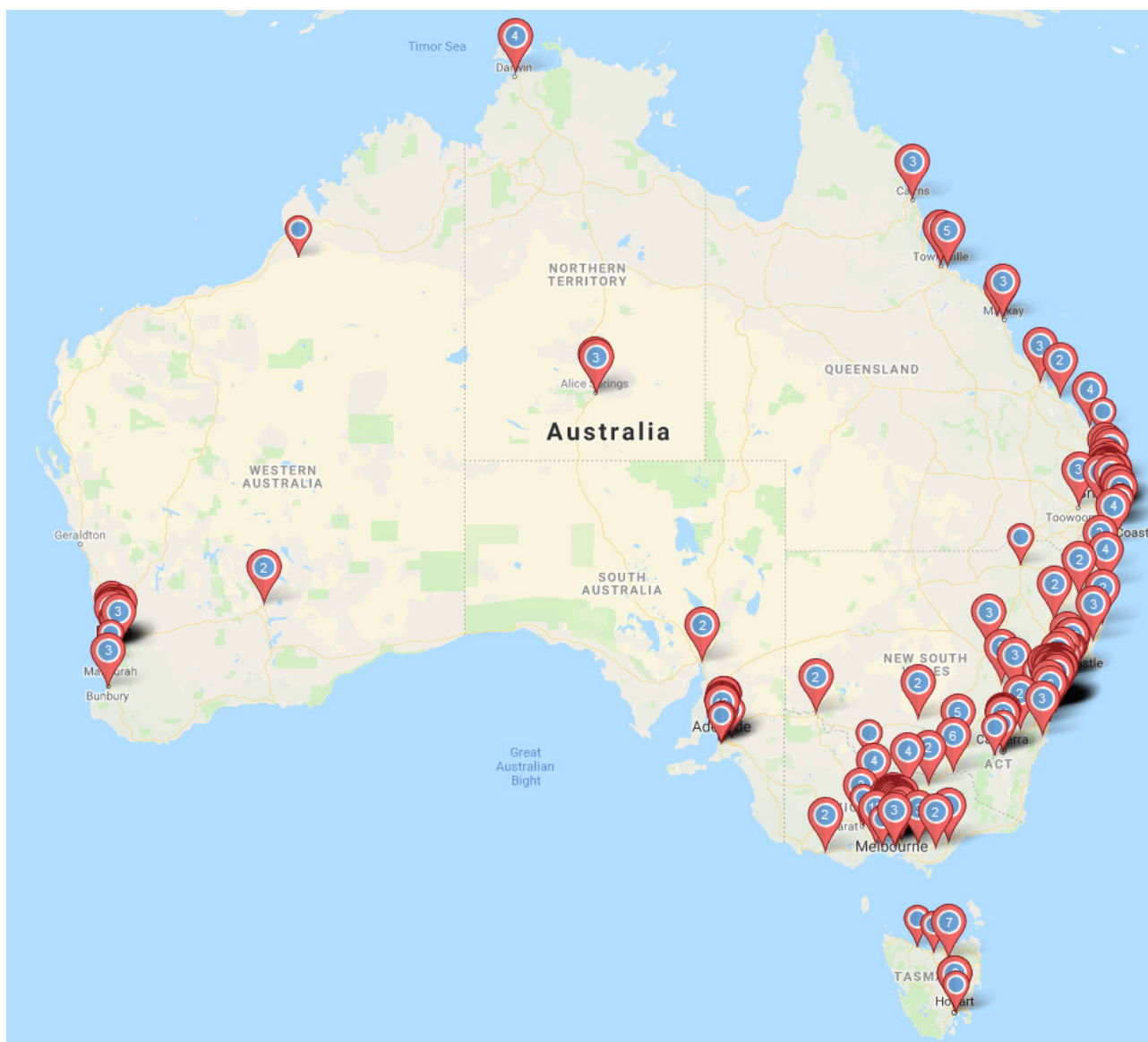
Figure 3. Geographical coverage of APSU contributors in 2018 (Maptive software)

features and clinical spectrum of disease due to congenital CMV; and (iii) to identify the therapy used for congenital CMV infection.